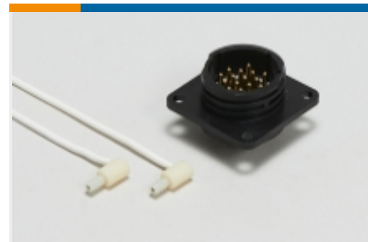
Circular Power Connectors(467)