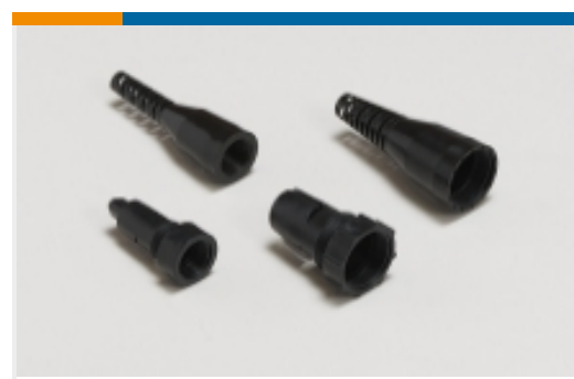
Circular Connector Boots &amp; Strain Relief(6)