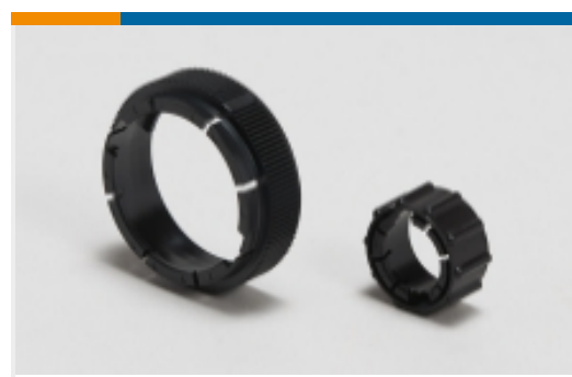
Circular Connector Adapters(7)